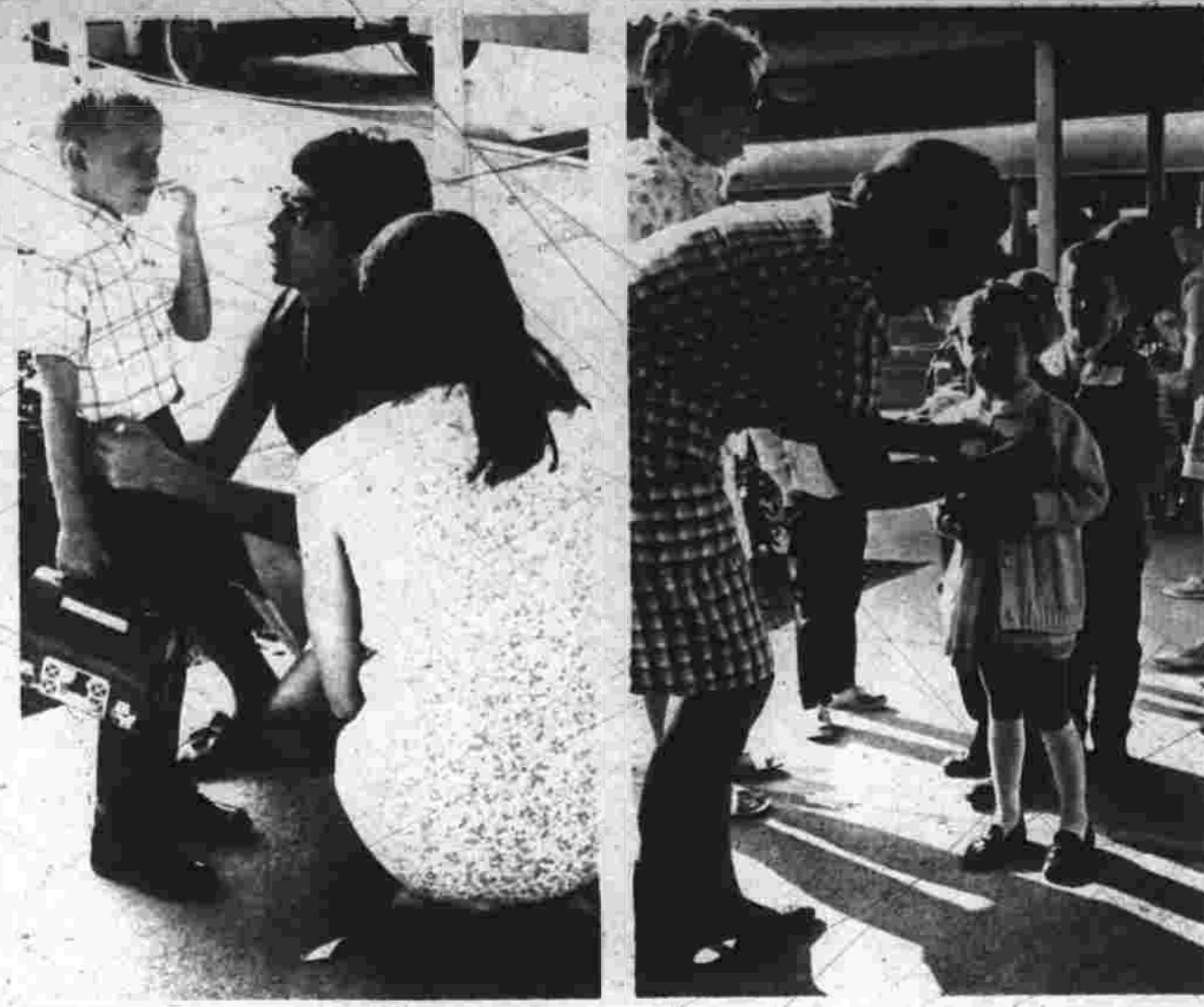
Boy with second thoughts on school is comforted. Nametags on children help prevent confusion.